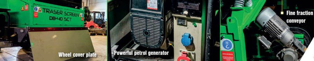
Wheel cover plate