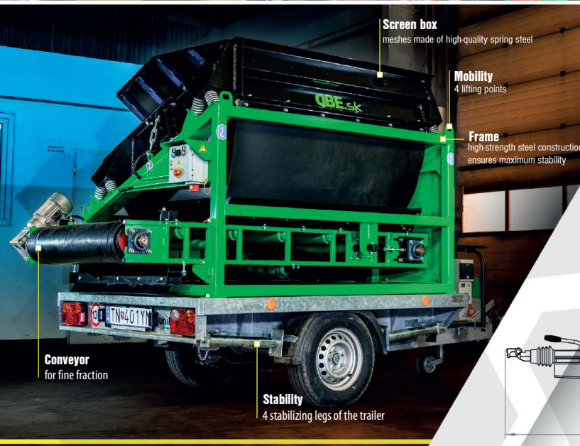
Screen box meshes made of high-quality spring steel