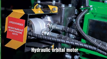
Hydraulic orbital motor