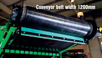
Conveyor belt width 1200mm