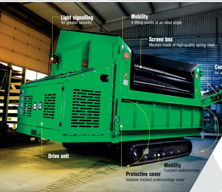
Light signalling for greater security