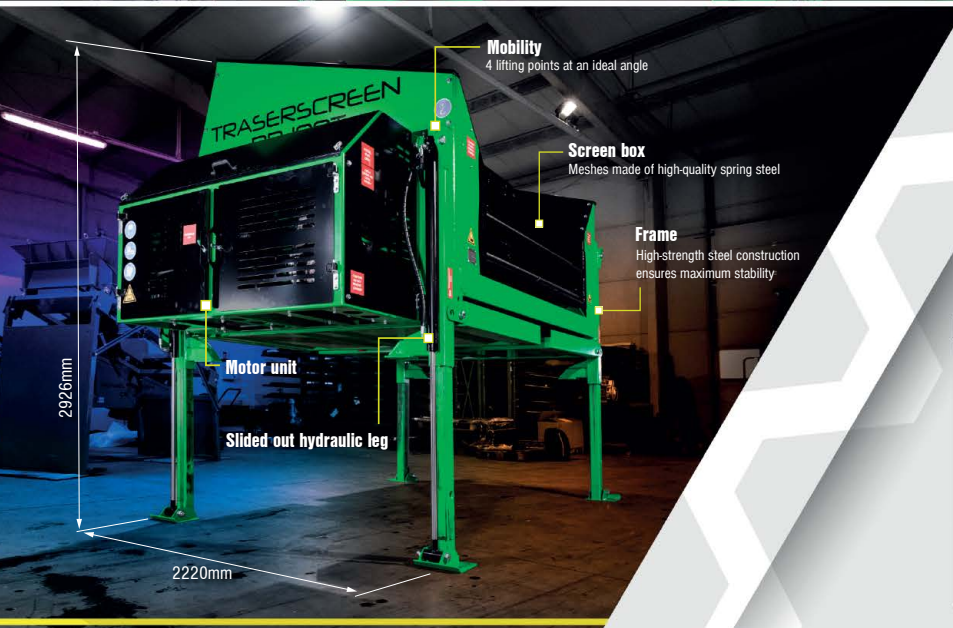
Mobility 4 lifting points at an ideal angle