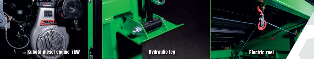
Kubota diesel engine 7kW